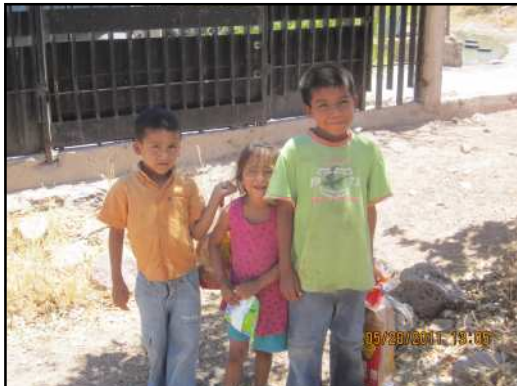
Bringing food home to Mom!