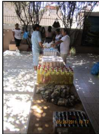
Preparing bags of food in the courtyard behind the Casa!