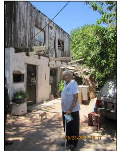
For the elderly, food is delivered to their home!