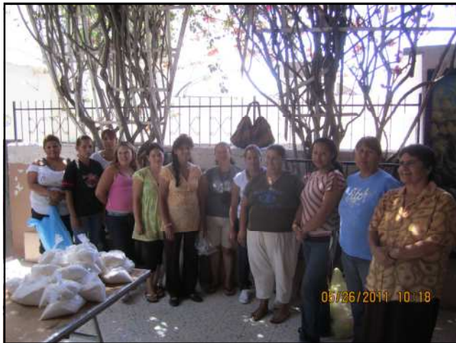
Volunteers at the Casa Franciscana make it happen!